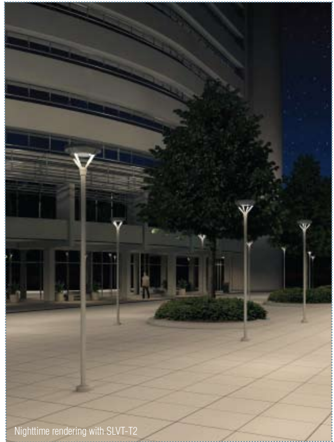
Nighttime rendering with SLVT-T2